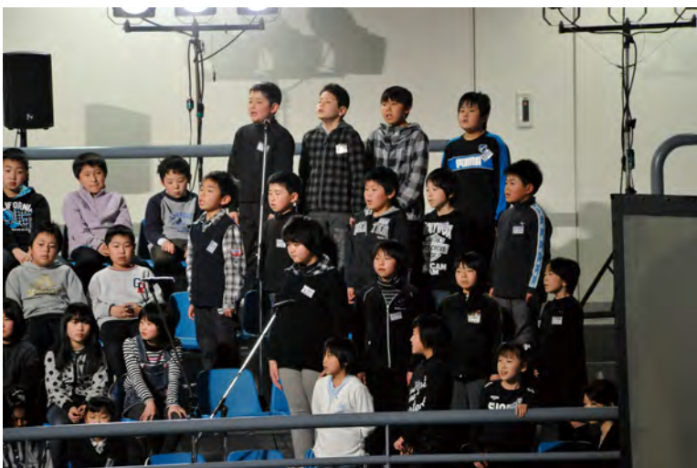
▲ Though few in numbers, the voices of the children of Natari Elementary School resounded exceptionally loudly.

Some teachers felt skeptical about this endeavor, wondering whether looking back on the year at this time would make the children feel unsettled and whether there was any meaning in writing such a song. Their worries soon evaporated. The song composed by the children was filled with images of the beauty of their hometown and the strong-mindedness of their hard-working community and family members. With great enthusiasm, the children and teachers practiced the song during homeroom hour each day. When they sang in the performance, the children's voices were powerful and confident, touching the hearts of the adults.