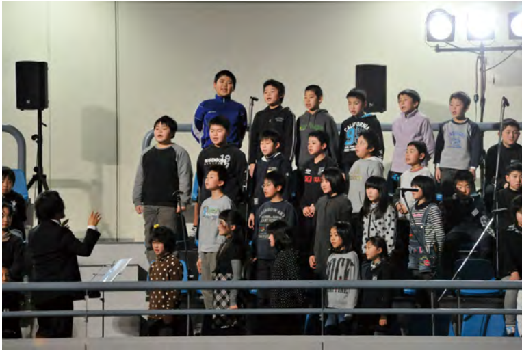
▲ The lyrics of the song written by the children of Isatomae Elementary School lifted the spirits of the adults who had worked so hard.