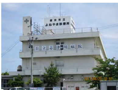
▲ On June 1st, 2011, Shizugawa Public Hospital opened as part of Tome Municipal Yoneyama Clinic with 39 inpatient beds.