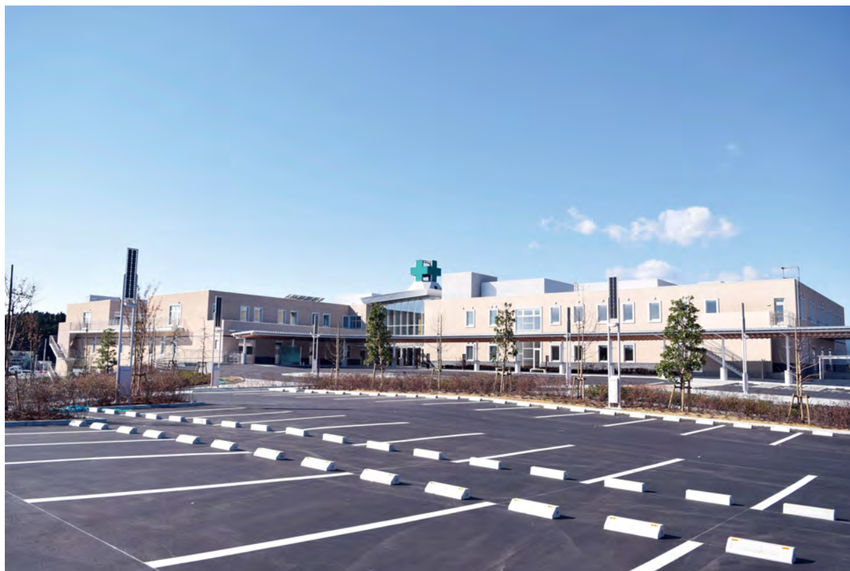
▲ With the support of relief funds from Taiwan Red Cross, the Minamisanriku Hospital and Social Welfare Care Centre Minamisanriku was built on high ground in Numata, Shizugawa after clearing forested land, and opened on December 14th, 2015.

Many of Minamisanriku's citizens were experiencing a sense of loss after the death of family and relatives; they were facing a dramatically changed environment in which they no longer had a home to return to. This made the restoration of medical and welfare services that safeguard people's health an urgent task. Minamisanriku Hospital and General Care Center Minamisanriku, a medical and welfare complex, was established in response to the grief of residents and lessons learned from the disaster. Functions provided by a hospital, health center, regional comprehensive support center, home nursing station, social welfare council, childcare support center, and the like were all consolidated into the one facility. The facility has space for supporting evacuees in the case of disaster, and for providing triage or first aid for injured persons. It is prepared for disaster situations with emergency generators of ample capacity to provide electricity, together with a variety of heat sources, including electricity, kerosene, LP gas, wood pellets, and solar power.