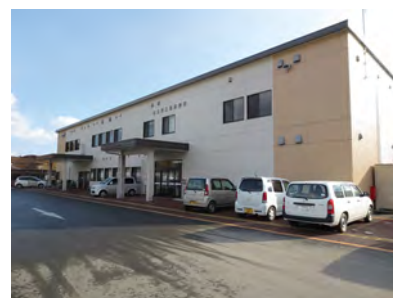
▲ On April 1, 2012, a temporary building was completed on high ground. The temporary Minamisanriku Public Clinic opened with the assistance of the Japanese Red Cross Society.