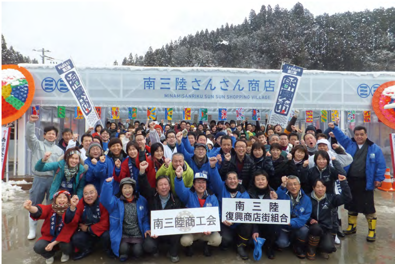
▲ Commemorative photo at the temporary Minamisanriku Sun Sun Shopping Village. Never without a smile on their faces, the shopkeepers of Minamisanriku walked the path to recovery with the support of people from all over the country.

Faced with the tragic reality that everything was lost in the tsunami, Minamisanriku shopkeepers at first found it difficult to even imagine rebuilding their businesses. However, the warm encouragement of the townspeople and the volunteers from all over Japan who visited the Minamisanriku Recovery Market, which was held soon after the earthquake, motivated the shopkeepers to get back on their feet.