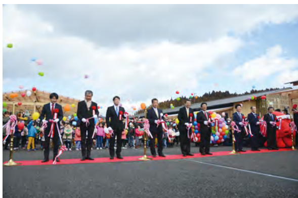
▲ On March 3rd, 2017, the permanent Minamisanriku Sun Sun Shopping Village opened on reclaimed land that had been raised 10 meters in the center of the Shizugawa District.

The shopping street has also won a range of awards based on its achievements. Their hearts filled with gratitude, the shopkeepers continue the hard work of creating a heartwarming shopping experience for people.