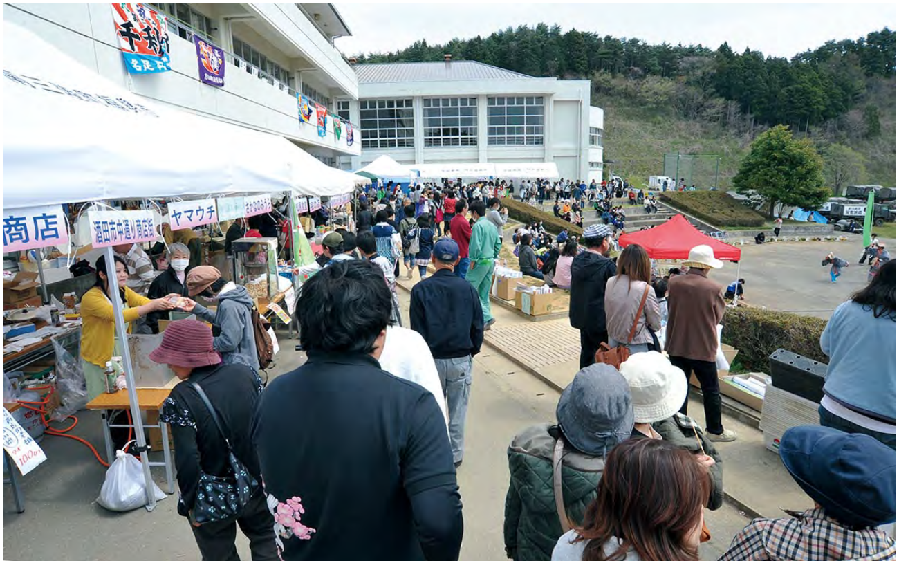
▲ The first Minamisanriku Recovery Market was held at Shizugawa Junior High School on April 29 and 30, 2011. The names of shops that had been destroyed by the tsunami were attached to the stall awnings. The market attracted an unanticipated number of townspeople from evacuation sites.

On April 29 and 30, 2011, about 50 days after the disaster struck, the first Minamisanriku Recovery Market was held at Shizugawa Junior High School.