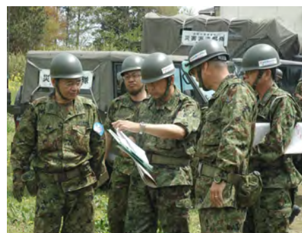
▲ Engineering commanders checking a site earmarked for temporary housing and discussing the land preparation plan.

Self-Defense Forces engineering companies were divided and assigned to different locations, and the steady work of clearing and leveling the narrow tracts of land continued without pause. Although conditions were not always favorable, the Self-Defense Forces used reliable technology and worked quickly to prepare the land for the construction of temporary housing facilities.