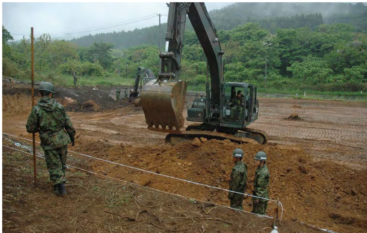
▲ Minamisanriku has little flat land, so it was necessary to develop new land for the construction of temporary housing. The Ground Self-Defense Force Northern Army took on the site preparation work.

Many Minamisanriku residents were looking forward to moving into temporary housing facilities as soon as possible. However, the ria coastal topography of Minamisanriku means that very few areas of flat land suitable for residential use exist, thus putting the issue of land development on the agenda. In terms of flat land, outside of school grounds there were only agricultural fields, where the ground had to be leveled in order to prepare it for residential construction.