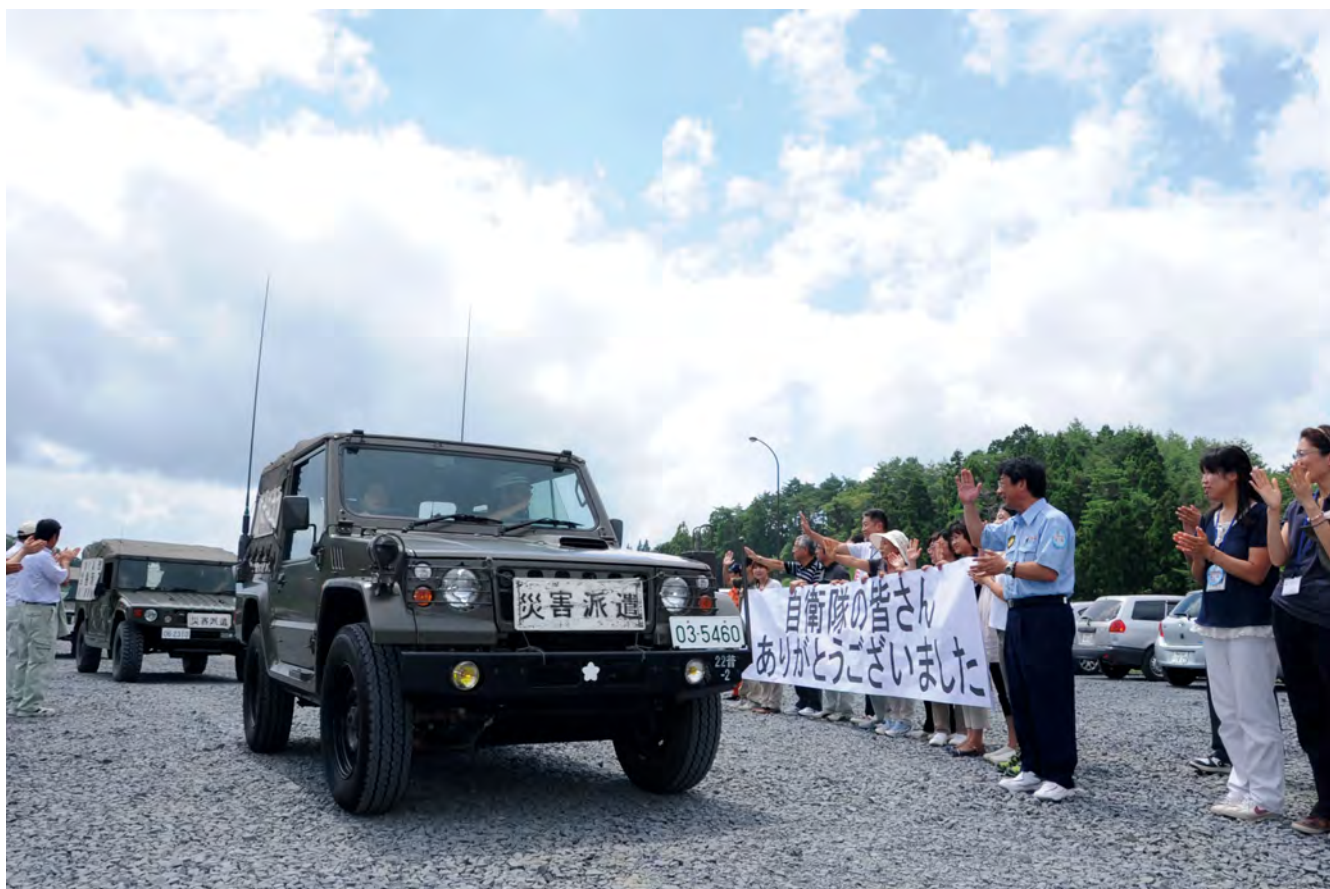
▲ Minamisanriku residents gathered along the roadside to bid farewell to the soldiers, constantly waving their hands.

Most of the Self-Defense Forces, which were stationed in Minamisanriku to search for missing persons and to support recovery efforts, were withdrawn at the end of June 2011. For Minamisanriku, a town that had lost all its infrastructure in the tsunami, the continued support of the Self-Defense Forces since the days immediately after the earthquake had been highly significant.