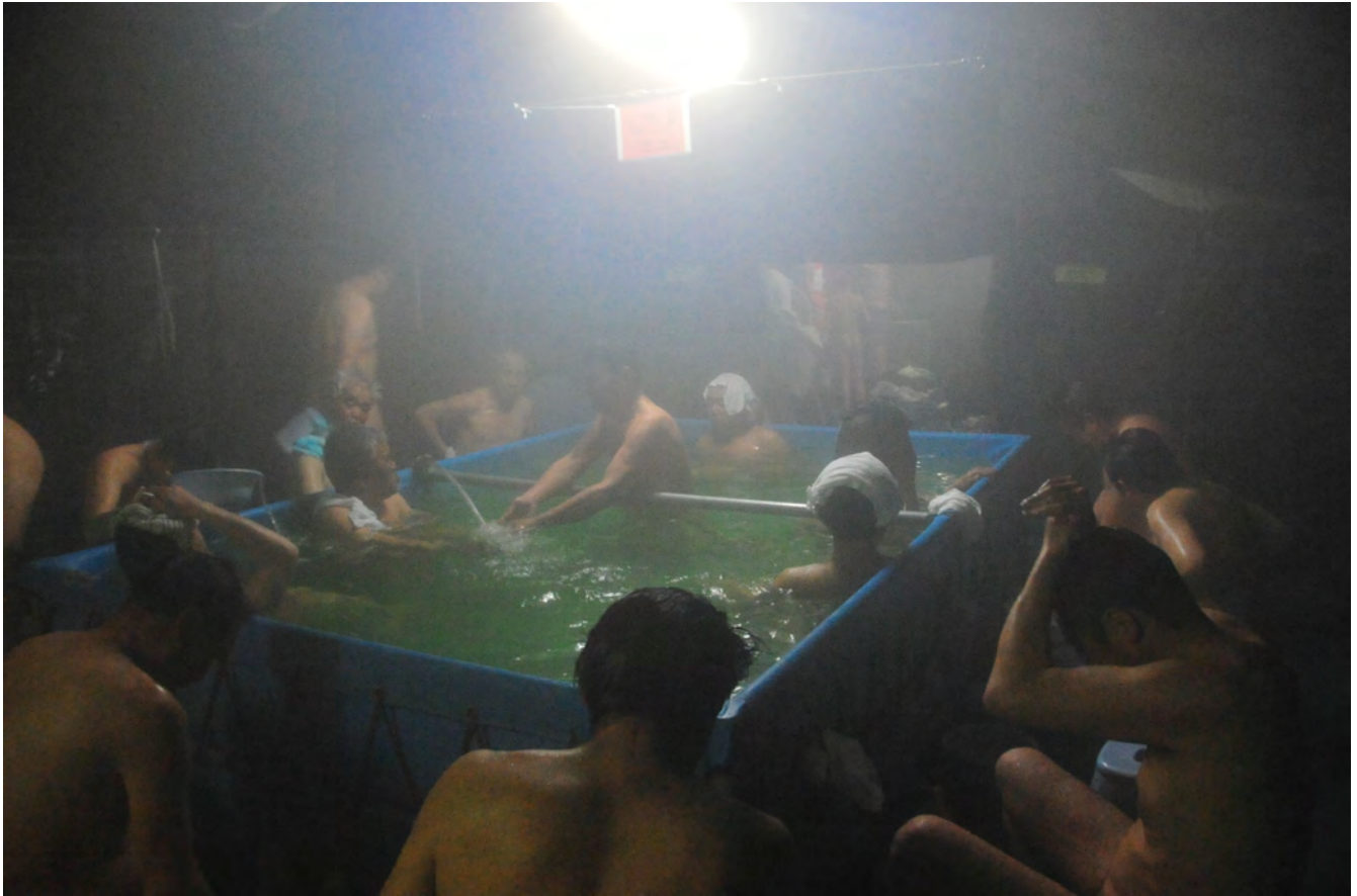
▲ A makeshift large bathtub in Numata, Shizugawa provided by the Ground Self-Defense Force Western Army 8th Division. People felt body and soul warm up in the large tub.

A makeshift large bathtub set up by Kumamoto-based Self-Defense Forces who came to the rescue filled up with warm steam. Washing their bodies all over and warming themselves in the bathtub, people felt their fatigue fade away. Forgetting the harsh reality of their rubble-filled town for a moment, everyone smiled.