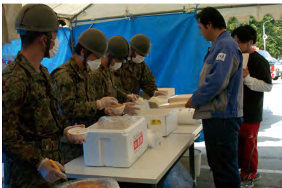
▲ Food distribution by the Ground Self-Defense Force Western Army 4th Division.

A makeshift large bathtub set up by Kumamoto-based Self-Defense Forces who came to the rescue filled up with warm steam. Washing their bodies all over and warming themselves in the bathtub, people felt their fatigue fade away. Forgetting the harsh reality of their rubble-filled town for a moment, everyone smiled.