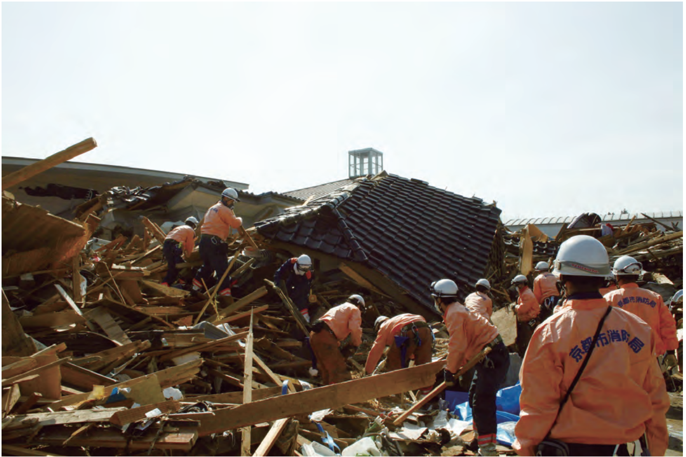
▲ Kyoto Fire Department's emergency firefighting aid team searches for survivors in the Shizugawa area the morning after the tsunami.