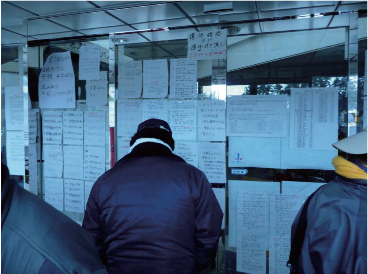
▲Residents at Bayside Arena reading postings about the deceased with a sense of prayer.