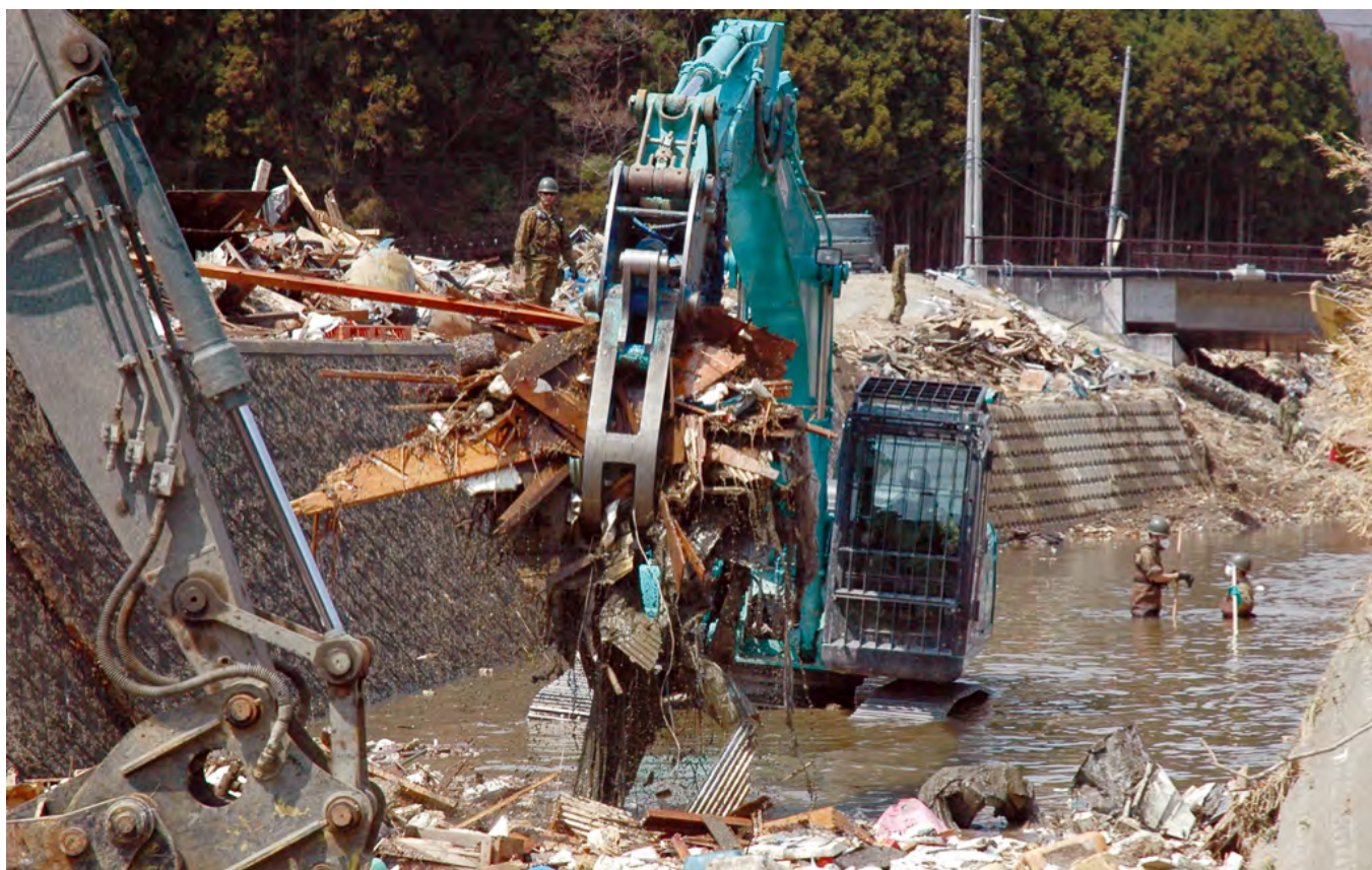
▲ April 26th, 2011 Search for missing persons, Tajiribatake, Shizugawa District