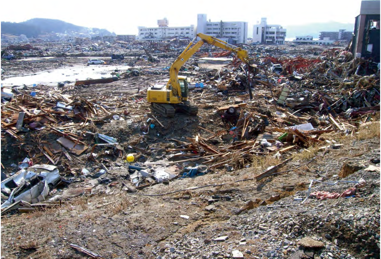
▲ From the day after the earthquake, heavy machinery owned by local construction companies was a constant sight in rubble-filled Minamisanriku.