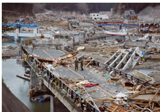
▲ The bridge on National Road 45 in Isatomae (Utatsu) was completely destroyed by the tsunami.

In the peninsula area, the tsunami destroyed road after road, leaving the people isolated for weeks. Because aid could not be delivered, people had to survive by foraging for food within their communities, they collected canned goods and unopened sweets found with the rubble to sustain their lives.